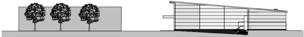
WEST - FRONT ELEVATION