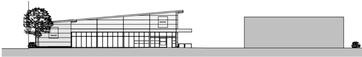
EAST - FRONT ELEVATION